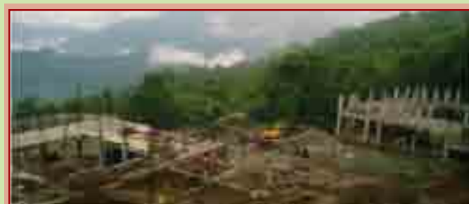
Permanent campus of NIELIT, Gangtok coming up at Pakyong, Sikkim

Construction is in progress for the permanent campus of NIELIT Gangtok centre at Pakyong, Sikkim under the Union Cabinet approved project sponsored by MeitY for upliftment of the Youths of NE States - "Development of NE Region by Enhancing the Training / Education Capacity in IECT Area".