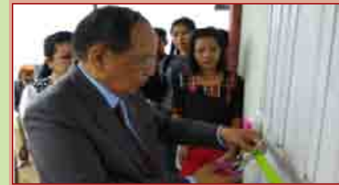
Shri C.L.Ruala, Hon'ble MP, Lok Sabha inaugurating the Study Centre

Lok Sabha at the premises of Community Hall, Khawllailung. The function was also graced by Smt. Vanlalawmpuii Chawngthu, Hon'ble Minister of State, Govt. of Mizoram.