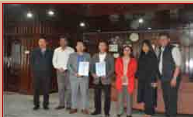
Signing of MoU between NIELIT Kohima and Department of Industries & Commerce, Govt. of Nagaland in the presence of officials from both parties

With the purpose to jointly collaborate for capacity building and skill development inline with the vision of Digital India, MoU between NIELIT Kohima and Department of Industries & Commerce, Govt. of Nagaland was signed on April 18, 2018. As per the MoU, Govt. of Nagaland shall provide build-up space for NIELIT Kohima to set up a centre at Dimapur, the commercial hub of Nagaland for skilling youth in ICT.