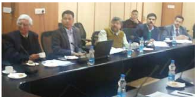
Meeting of the Committee in progress