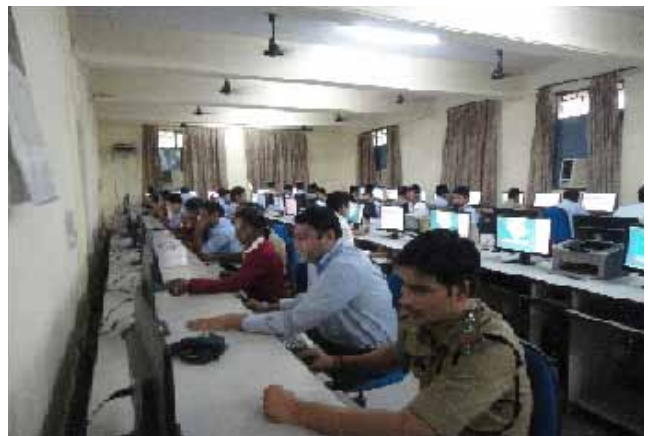
Online examination for Bureau of Civil Aviation Security (BCAS) in progress at NIELIT Centre, Delhi