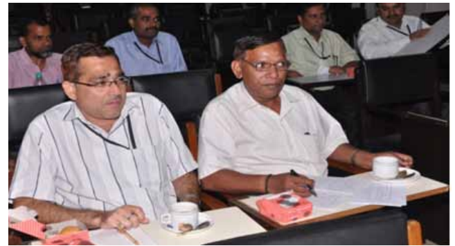
हिन्दी कार्यशाला के दौरान उपस्थित अधिकारी व कर्मचारीगण

राष्ट्रीय इलेक्ट्रॉनिकी एवं सूचना प्रौद्योगिकी संस्थान द्वारा राजभाषा हिन्दी को बढ़ावा दिये जाने के प्रयोजनार्थ 'राजभाषा नियम' विषय पर एक कार्यशाला का आयोजन दिनांक 13 सितम्बर, 2013 को कार्यालय के सम्मेलन कक्ष संख्या 1008 में किया गया। इस कार्यशाला का मुख्य उद्देश्य राजभाषा नियम के तहत उपनियमों व प्रावधानों से कार्यालय स्तर पर अधिक से अधिक अधिकारियों एवं कर्मचारियों को अवगत कराना था। ताकि, सभी राजभाषा नियमों के तहत समस्त प्रावधानों से विज्ञ होकर सरकारी कामकाज में हिन्दी भाषा का प्रयोग अधिक से अधिक कर सकें। साथ ही नियमों का अनुपालन भी सुनिश्चित करने हेतु स्वयं का उत्तरदायित्व व कर्तव्य भी समझें।