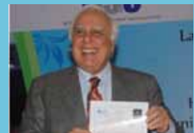
Shri Kapil Sibal, Hon'ble Minister for Communications & IT and Law & Justice with the NIELIT BCC Certificate which were awarded to successful candidates during the event

LAUNCH OF E-INCLUSION PROJECT: The Common Service Centres (CSCs) are also to roll out e-Literacy programmes under the CSC-SPV scheme. The CSC network is being also used to empower rural India through NIELIT's CCC and BCC programmes. In a glittering event held on November 24, 2013 at the India Habitat Centre, New Delhi, the e-Inclusion project was launched by Shri Kapil Sibal, Hon'ble Minister for Communications & IT and Law & Justice. The e-inclusion project aims to make one person in each household e-literate. The Hon'ble Minister in his inaugural address also highlighted the significance and role of NIELIT in the proliferation of Digital Literacy in this country. The Hon'ble Minister also handed over the NIELIT BCC certificates to select candidates drawn from the remote corners of India, who have successfully completed NIELIT's BCC programme. The inaugural session was followed by a Panel Discussion on 'Potential of CSC Network in extending e-Literacy to Rural India' chaired by Dr. Rajendra Kumar, IAS, Joint Secy, DeitY | BASAB DASGUPTA, ANURAG SHAH