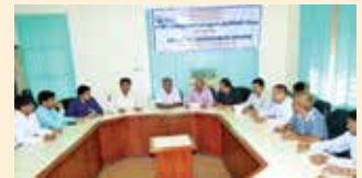
Discussion on vigilance matters at NIELIT Gorakhpur in progress

In line with the initiatives and guidelines issued by NIELIT HQ, Vigilance Awareness Week was celebrated across all NIELIT Centres. In this regard, Vigilance Awareness Week at NIELIT Centre, Gorakhpur was observed during October 26-31, 2015.