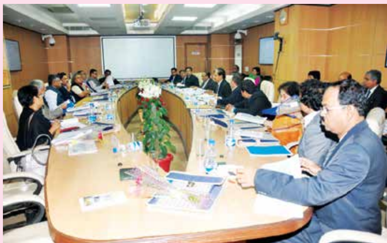
Meeting of 33 rd NIELIT GC under the Chairmanship of Shri Ravi Shankar Prasad, Hon'ble Minister of Communication & IT and Chairman, GC, NIELIT in progress

The 33 rd Meeting of the Governing Council of NIELIT was held under the Chairmanship of Hon'ble Minister for Communication & Information Technology, Shri Ravi Shankar Prasad on November 28, 2015 at New Delhi. With the inclusion of new members from Industry and Academia, the Council deliberated on many key issues, including capacity building and skill development initiatives in state-of-the-art technologies that NIELIT proposes to undertake.