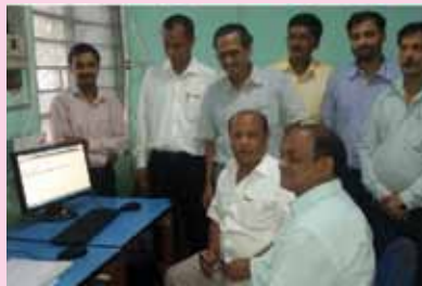
NIELIT officials monitoring the Cybergram exam through Procter Mode at NIELIT Kolkata

The Ministry of Minority Affairs, Government of India has launched a program named Cybergram Scheme under Minority Multi-sectoral Development Programme (MsDP) under which students of classes sixth to tenth will be provided training in digital literacy. Initially, the scheme is being implemented in West Bengal for 1,70,005 number of students from 614 Madrasahs in the state. Ms. Mamta Banerjee, Hon'ble Chief Minister of West Bengal felicitated about 169 member of minority committee for their achievement in various field during a programme at the Netaji Indoor Stadium Kolkata on September 21, 2015. The event was also attended by officers of NIELIT Kolkata