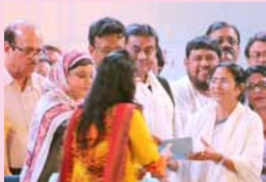
Ms. Mamta Banerjee, Hon'ble Chief Minister, West Bengal distributing certificate to BCC students under Cybergram project