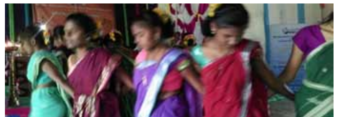
Adivasi 'Tarpa' dance being performed during the inaugural ceremony