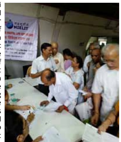
Officials of NIELIT Delhi Centre facilitating pensioners during the Jeevan Pramaan Camp

NIELIT Centre Delhi has been designated as Nodal Centre for the implementation of the Scheme of Jeevan Pramaan- biometric enabled digital service for the pensioners of Central/State Government organizations. Jeevan Pramaan seeks to ease the whole process of issuing a digitally signed life certificate to pensioners so that they do not need to run from one office to another in order to get their pensions. In the endeavor of registering pensioners for Digital Life