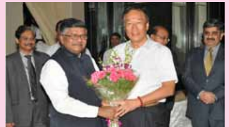
Shri Ravi Shankar Prasad, Hon'ble Minister of Communication & IT welcoming Mr. Terry Gau, Chairman, Foxconn - a multinational electronics manufacturing company which has proposed to set base in India in association with the Adani Group.