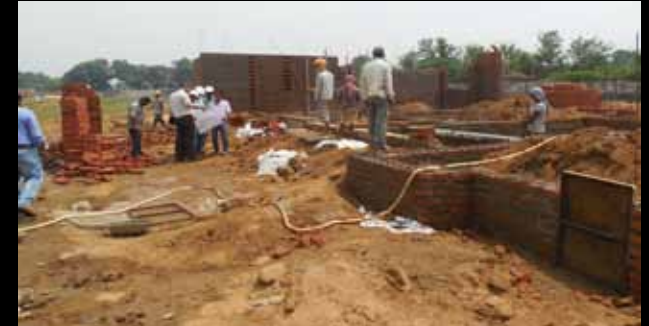
ulbyV dñl fuelZk dk Z

बिहटा, पटना स्थित नाइलिट पटना के शैक्षणिक एवं प्रशासनिक भवन का निर्माण कार्य प्रारम्भ हो चुका है। सम्भवतः इन दोनों भवनों का निर्माण २०१७-२०१८ के अंत तक सम्पूर्ण हो जायेगा। वर्तमान में नाइलिट पटना, बिस्कोमॉन टॉवर के 99वीं मंजिल पर आवंटित ८००० वर्ग फीट जगह में निर्मित केंद्र से कार्य कर रही है। इस केंद्र पर नाइलिट के विभिन्न पाठ्यक्रमों के अलावा बिहार एवं केंद्र सरकार द्वारा संचालित अन्य कार्यक्रम भी चलाये जा रहे हैं। इस वित्तीय वर्ष (२०१५-२०१६) में नाइलिट पटना द्वारा संचालित कार्यक्रमों से अभी तक लगभग ३५०० लोग लभापित हो चुके हैं। इस वित्तीय वर्ष से नाइलिट पटना ने भेकड क्षेत्र में भी कार्य करना प्रारम्भ कर दिया है।