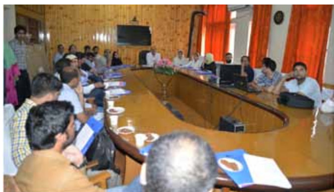
Training Session of School Teachers in progress at NIELIT Centre Jammu