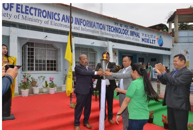
Figure 3: Inauguration of annual sports meet event

The students of the Centre participate in the various types of sports. Out of them Cricket, Volleyball, Badminton, Carom and Chess are quite popular. The students of the Centre also participate in Inter College Sports events under Manipur University as well as All India Inter university Sports events representing M.U. Many of the students of this Centre also bagged medals in these State Level as well as National Level Sports events. The Centre also organized Inter College Sports Tournaments in its Campus under the aegis of M.U.