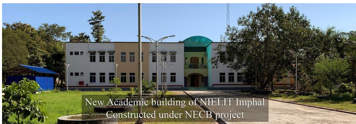
Figure 1: New Academic Building

The campus of NIELIT Imphal is located at Akampat, Imphal East, Manipur about 5 kms in the south-east direction from the heart of the city. It is about 0.5 Km away from Singjamei Market.