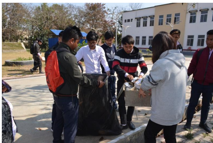
Figure 4: Swachh Bharat

Not only in sports events, students of this Centre also participated in much other State Level competition like IT Talent Search, Debating Competition, Essay Writing Competition, etc. and bagged prizes. In fact, students of this Centre are showing excellent performance in many other