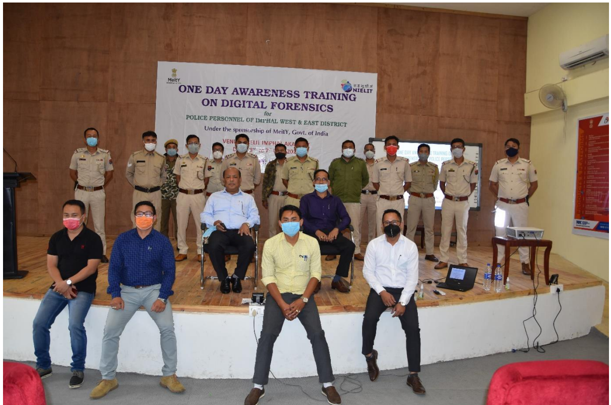
Figure 2: Awareness Program on Digital Forensics

NIELIT Imphal specializes in development of skill in the fields of Electronics & Communication Engineering and Information Technology through various long term and short term courses. NIELIT Imphal also implements various PMKVY skill development courses in the field of IT, Electronics, Renewable energy etc. There are 16 trainers in 10 different Job Roles in Electronic Sector and 03 trainers in 03 different job roles in IT Sector.