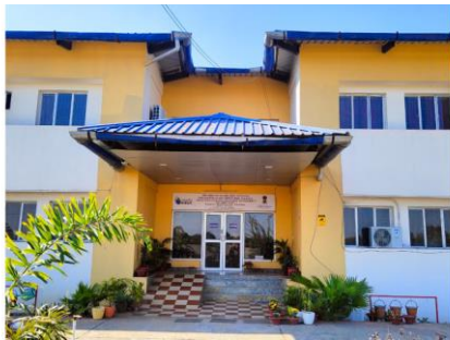
NIELIT Tezpur Extension Centre –Academic block