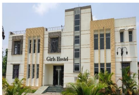
NIELIT Jorhat Extension Centre –Girls' Hostel