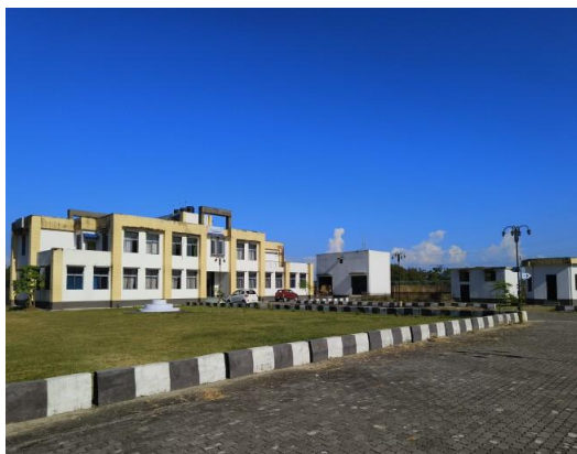
NIELIT Dibrugarh Extension Centre –Academic Building

Class rooms /Labs are equipped with Interactive Panel display, Projector etc . Internet facility & LAN connectivity in PCs of all labs and Lecture halls.