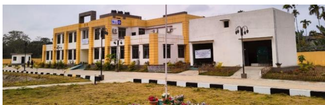
NIELIT Jorhat Extension Centre –Academic block