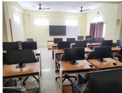
NIELIT Tezpur Extension Centre –Computer Lab