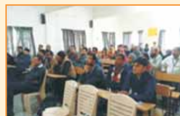
Trainers Teachers and students of Maulana Azad College

Patna: NIELIT Patna conducted a 2 day ISEA workshop for Employees of Bihar Industrial Area Development Authority (BIADA), Govt of Bihar during 29-30th, November, 2018. A total 34 employees participated in the workshop. A similar workshop was organized for the students and employees of Maulana Azad College of Engineering and Technology, Patna on 5th December, 2018. A total of 58 participants attended the workshop.