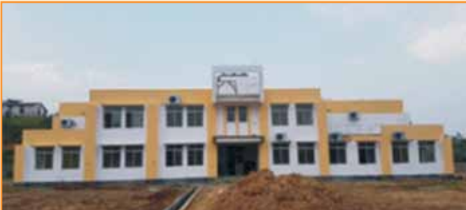
Churachandpur Extension Centre

Churachandpur Extension Centre: Approximately 60% of the construction work is completed.