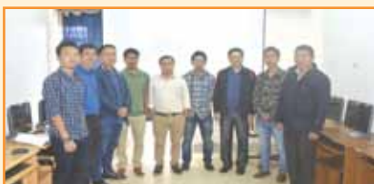
ISEA Workshop with Government Officers

Kohima: As part of ISEA Programme initiated by the Government of India, NIELIT Kohima is conducting continuous training for school and college students and also for government officials. So far, 150 officials and 700 students and teachers have been trained.