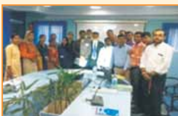
BIADA employees with expert Trainers of Engg. & Technology, Patna

Patna: NIELIT Patna conducted a 2 day ISEA workshop for Employees of Bihar Industrial Area Development Authority (BIADA), Govt of Bihar during 29-30th, November, 2018. A total 34 employees participated in the workshop. A similar workshop was organized for the students and employees of Maulana Azad College of Engineering and Technology, Patna on 5th December, 2018. A total of 58 participants attended the workshop.