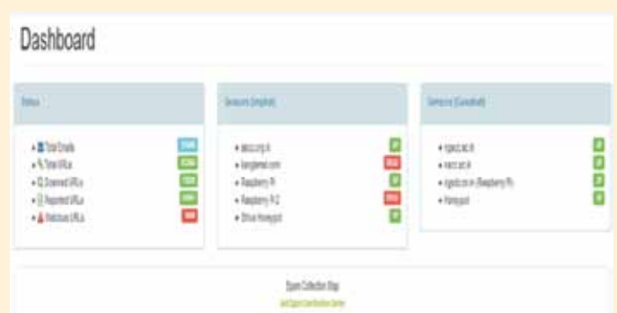
Dashboard indicating statistical outcome of the project