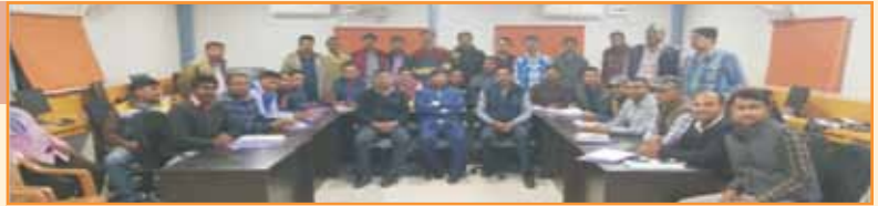
Employees of Bihar Police Cyber Cell with NIELIT Expert Trainers.

Patna: A workshop on IP, Website and e-Mail Tracing for the employees of CYBER CELL, Bihar Police was organized by NIELIT Patna on 12th December, 2018.