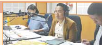
A live talk was telecasted on All India Radio Kohima Station on Information Security Education and Awareness focussed on social networking, online banking, and online shopping

Kohima: As part of ISEA Programme initiated by the Government of India, NIELIT Kohima is conducting continuous training for school and college students and also for government officials. So far, 150 officials and 700 students and teachers have been trained.