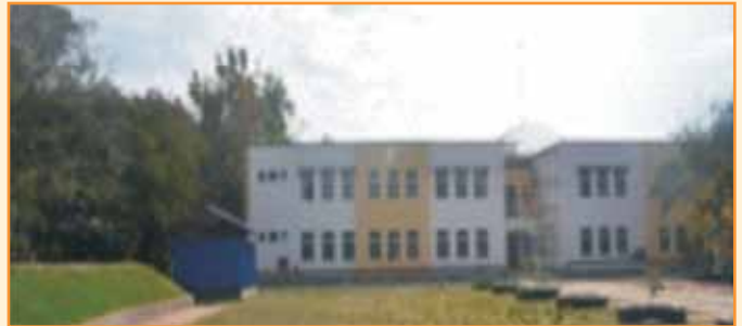
New Academic Block of NIELIT Imphal is ready for Inauguration

Imphal: Approximately 90% of the construction work is completed of the new Admin & Academic Block of NIELIT Imphal.