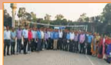
PGT Trainees with Master Trainers at KVS, Kankarbagh, Patna