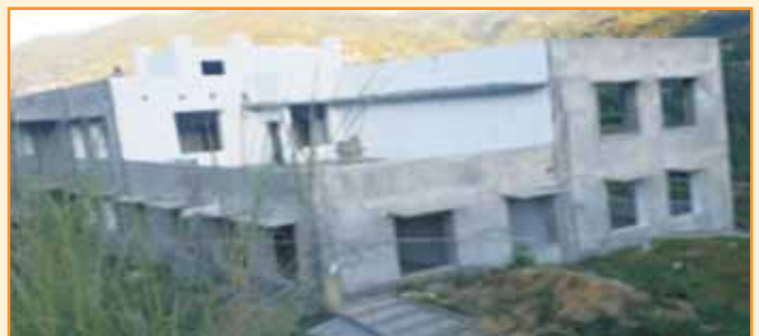
Administrative Block at NIELIT Senapati site

Chuchuyimlang: 75% of the construction of building is completed. During April-November, 2018 259 students have been trained at the Centre and revenue generated from April 2018 - November, 2018 is Rs. 9,06,500.