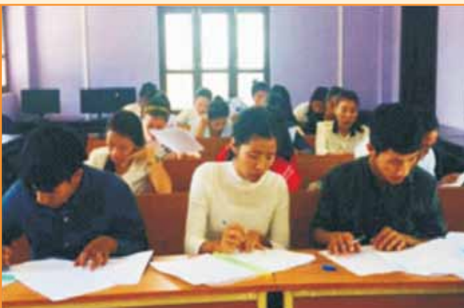
Students participating in the placement drive written test.

Srinagar: Model Career Centre, NIELIT Srinagar organized placement drive to hire IT Professionals for UNOSIS IT Solutions Pvt. Ltd, Srinagar for the posts of Technical Support Specialists and Diagnostic Technical Support (Sales). Around 145 candidates registered and appeared in interview, 38 candidates were shortlisted and 20 candidates were selected. Out of 20 candidates, 10 candidates were selected for the post of Technical Support Specialists and 10 candidates were selected for the post of Diagnostic Technical Support on November 26, 2018 at Model Career Centre, NIELIT J&K, SIDCO Electronics Complex, Rangreth, Srinagar.