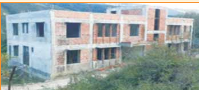
Ladies Hostel at NIELIT Senapati site

Senapati Extension Centre: Approximately 50% of the construction work is completed.