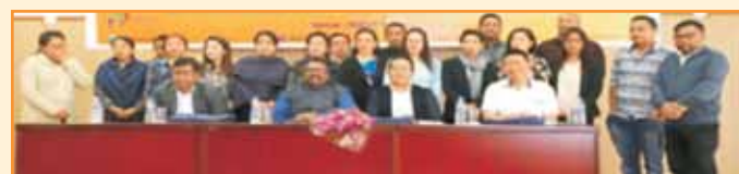
Training imparting to Army officials on IT & Digital payment

Kohima: Around 150 government officials have been trained so far from various departments in Nagaland.