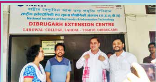
Seen in the picture are Sri Kamakhya Prasad Tasa, Hon'ble Lok Sabha MP from Jorhat with the Principal of Lahowal College and officials of NIELIT Dibrugarh Extension Centre.

Sri Kamakhya Prasad Tasa, Hon'ble MP from Jorhat, Assam visited the newly commissioned NIELIT Extension Centre at Dibrugarh on April 12, 2017 and held discussion with the Officer incharge of NIELIT Dibrugarh EC and other faculty members. NIELIT Officials apprised the Hon'ble MP about various training programs being conducted by NIELIT in its Dibrugarh Extension Centre.