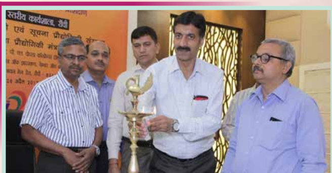
Inauguration of the State Level Workshop of Digital Payment at Ranchi