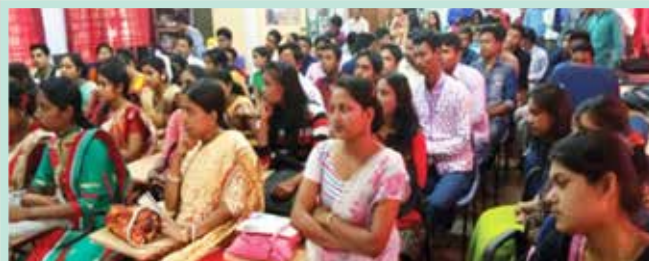
Participants attending the programme