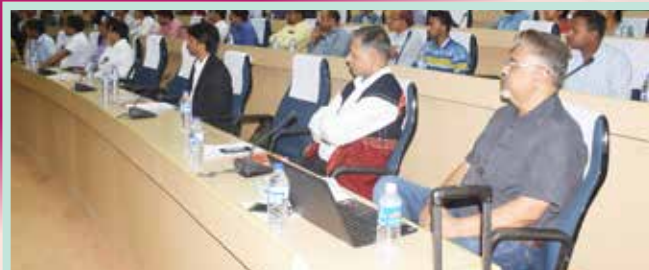
Participants of the ESDM workshop at Pragna Bhawan, Agartala