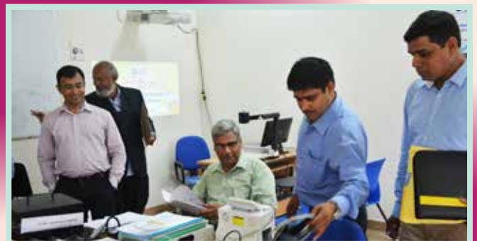
Inspection of Medical Electronics lab by AICTE Expert Committee in presence of Director-Incharge, NIELIT Agartala

NIELIT Centre Agartala is all set to conduct formal engineering courses namely Diploma in Engineering in Computer Science & Technology and Diploma in Engineering in Electronics and Telecommunication Engineering in association with Tripura University. In this regard, All India Council for Technical Education (AICTE) has granted its approval after carrying out due inspection of the necessary infrastructure and expertise required to conduct such courses. The youth of the state will greatly benefit as both the courses has an intake capacity of 60 candidates for the academic year 2017-18.