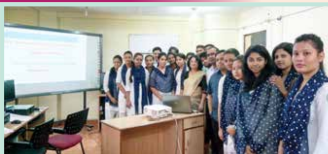
Students of Department of Zoology, Arya Vidhapeeth College, Guwahati seen with the mentors in the Awareness camp organised by NIELIT Guwahati

NIELIT Guwahati organised a two days Awareness Camp for ICT applications in Biology for the students of local colleges April 6-7, 2017 at its campus located in Paltan Bazar, Guwahati. The special camp was targeted for graduate students of Biology to create awareness in Bioinformatics and Computational Biology.