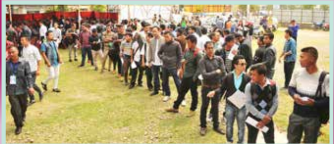
Job Seekers in queue during the Job Fair registration