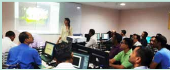
A glimpse of training session