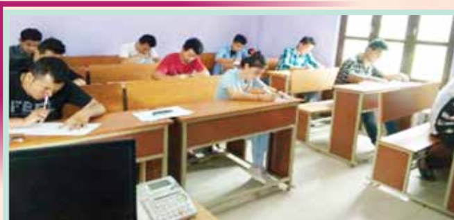
Jobseekers appearing in a written test conducted by MCC Imphal