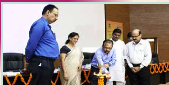
Inauguration of State Level Digidhan Workshop at Adhiveshan Bhawan, Patna

NIELIT has been assigned the responsibility of the project entitled 'On-boarding of self-organized small and medium businesses / traders on digital payment initiatives' by the Ministry of Electronics and Information Technology (MeitY), Govt. of India. The objective of the project is to understand and adopt simplified digital payment mechanisms like UPI, USSD, BBPS, AEPS etc. in a convenient manner, which would contribute towards establishing digital economy and conveying the benefits of digital payment to traders through capacity building programs. Under the project, A state level workshop was organized by NIELIT Patna Centre at Adhiveshan Bhawan, Patna on May 29, 2017.