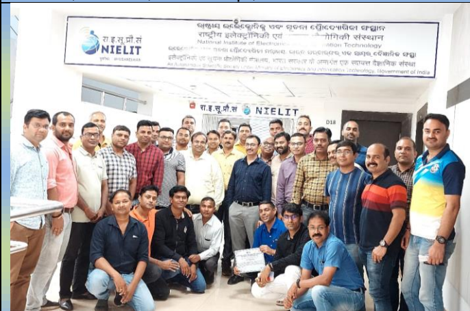
12 week Pre Release Course for Defence Personnel's on Certified Multimedia Developer under DGR