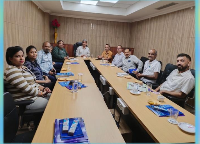
Director General NIELIT alongwith Director I/C & Officers of NIELIT interacted with accredited centers as well as interacted with local industries to understand their manpower requirements, internship opportunities etc.