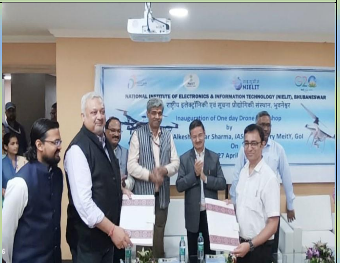
NIELIT Bhubaneswar signed MoU with Sri Sri University for Capacity Building, Resources sharing, Joint Certification, Skilling/ Upskilling areas