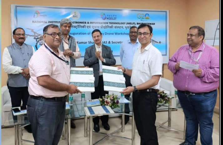
NIELIT Bhubaneswar signed MoU with Karkhana-Sudolearn Solutions Pvt Ltd for specialized training in Future Skills, Emerging areas, Drone technology etc.,