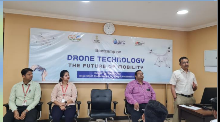
Bootcamp on Drone Technology organized by NIELIT Bhubaneswar with 42 participant concluded