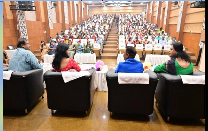
Hands-on session on Women's Security @CyberSpace on International Womens Day at KIIT by NIELIT BBSR