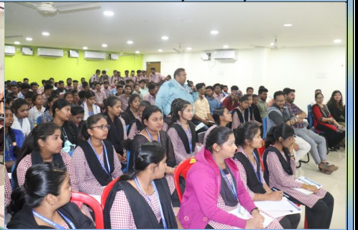
NIELIT Bhubaneswar conducted a Workshop on Cyber Security, Future Skills & Emerging Technologies including Drone Technology at Govt Polytechnic, Malkangiri