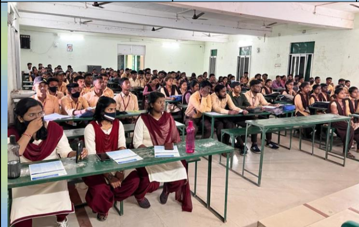
NIELIT Bhubaneswar conducted a career counseling workshop for students and faculties of Government College, Sundargarh